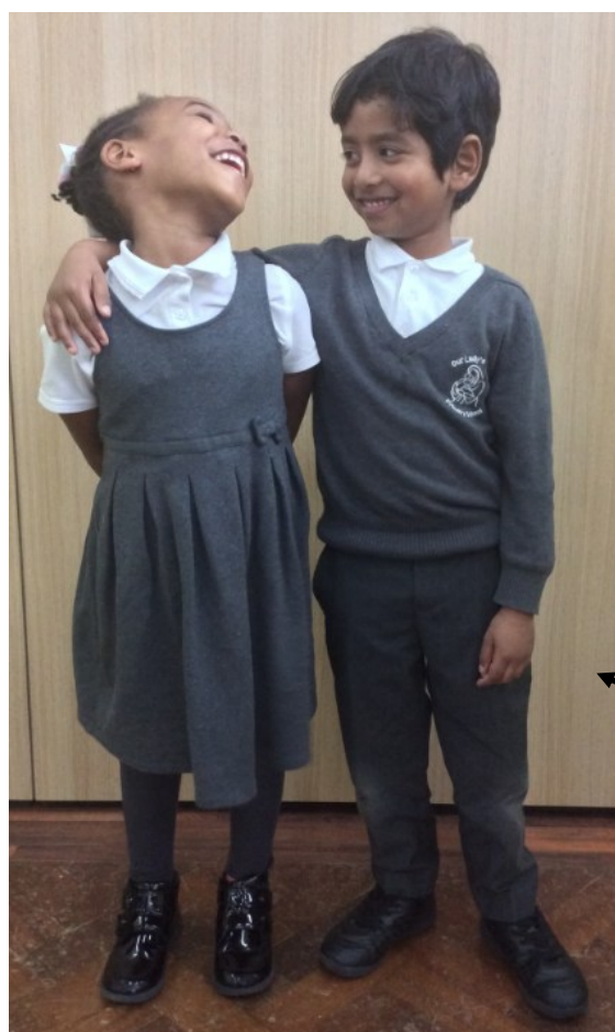
Key Stage 1