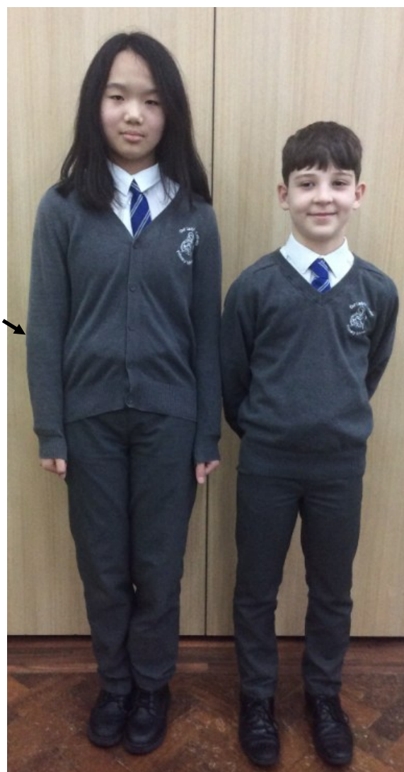
Key Stage 2