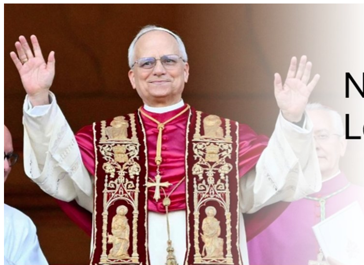
New Pope Leo XIV

In his first words as Pope, Leo XIV spoke fondly of his predecessor Francis. "We still hear in our ears the weak but always courageous voice of Pope Francis who blessed us." "United and hand in hand with God, let us advance together," he told cheering crowds.